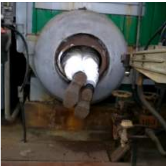
Figure 4. Research work at Politecnico di Milano

The technical standards of importance for the design of pressure vessels are developed at Euro-pean level.