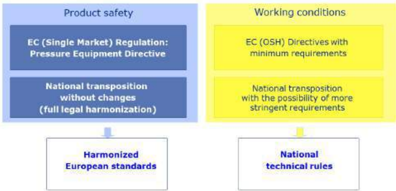
Figure 3: Statutory references for product properties and operation