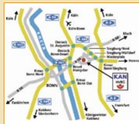
General plan and detailed plan of St. Augustin

Approaching from the south: on the A 3 motorway (Frankfurt-Cologne), take the A 560 signed for Bonn at the Bonn/Siegburg motorway junction. Leave the A 560 immediately at the first exit (Niederpleis). Turn right, following the signs for Niederpleis. At the traffic lights about 1.1 km after the "Niederpleis" place-name sign, turn left into Alte Heerstrasse (signed "HVBG"). After another 1.7 km, turn right into the HVBG entrance.