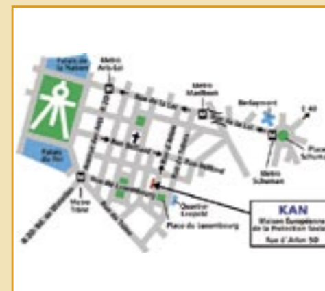
Detailed plan of Brussels

KAN Kommission Arbeitsschutz und Normung